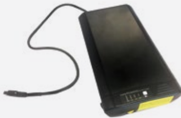
High-performance lithium ion battery with power supply