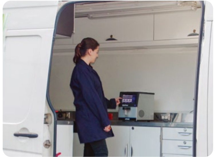
Mobile Lab is enclosed climate controlled lab with ambient temperature and humidity within product specification to obtain desired performance.

We used only the best materials to ensure it delivers unmatched performance in any application, and tested through intense shock, vibration and drop, per applicable IEC procedures.